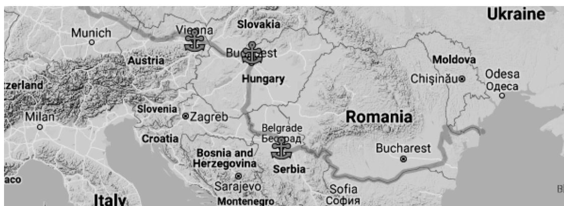
Figure 2 The 3,500-km waterway of Rhine-Main-Danube: highlighted ports: Vienna (Austria), Budapest (Hungary), Belgrade (Serbia).