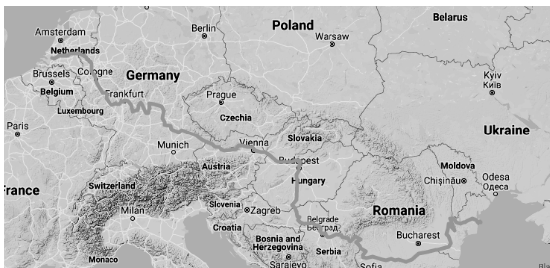
Figure 1 The 3,500-km waterway of Rhine-Main-Danube.